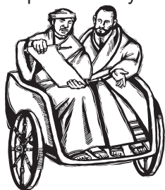
Philip Teaches the Ethiopian

The keeper of the Gaza (treasure) knew value. He found the Pearl of Great Price! So can you. ■