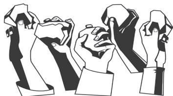
The Stoning of Stephen

God does not prevent the plottings of wicked men, but He causes their devices to work for good to those who in trial and conflict maintain their faith and loyalty. Often the gospel laborer carries on his work amid storms of persecution, bitter opposition, and unjust reproach. At such times let him remember that the experience to be gained in the furnace of trial and affliction is worth all the pain it costs. Thus God brings His children near to Him, that He may show them their